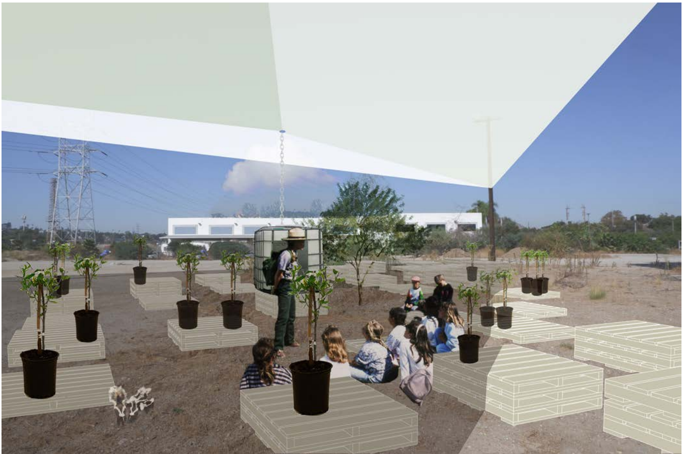
Figure 2. QSU: Kids get a lesson about their local ecology from a park ranger under the shade canopy.

Reconnecting the ecological and the social, degrowth repoliticizes environmentalism. As similar efforts to re-engage political debates emerge within the field of architecture, architects cannot let the political economy go unchallenged. What might an architecture of living within our means look like? What is an architecture that does away with ‘grow or die’? How does architecture practice sufficiency, rather than efficiency? Challenging the economic foundations of the field will impact the practice of architecture at all levels.