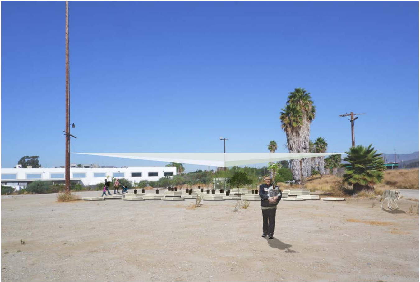
Figure 3. QSU: A tenant takes home a liveoak to plant in their backyard.

“Unlike failed radical projects of the past, degrowth does not offer only a new way of realizing humanity’s dreams; it changes the dreams themselves.”