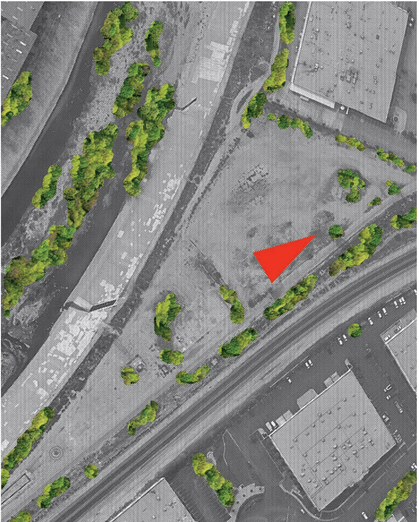
Figure 4. QSU: The site plan of the pirate nursery reveals an ecological occupation of the gentrifying neighborhood around the project's site. Image by author.